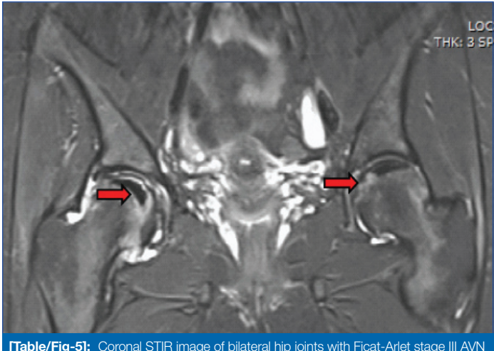
[Table/Fig-5]: Coronal STIR image of bilateral hip joints with Ficat-Arlet stage III AVN on both sides with double line sign (red arrows), BME and joint effusion.

55.5 years and all patients presented in the 5<sup>th</sup> to 7<sup>th</sup> decades. A 60% (n=6) were males. Commonest MRI abnormality seen in patients of OA was BME in the femoral head and neck on T1W images which was found in 86.67% of OA affected hips [Table/Fig-6].